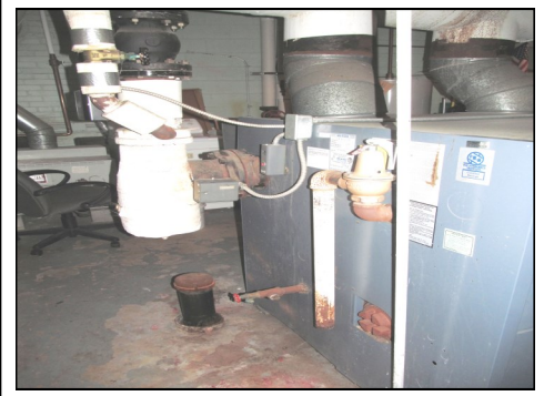
40-Year-Old Boiler at J. Harvey Rodgers School

Question 2 Project Cost: $9.77 million Estimated tax impact: $51 a year or 14¢ a day on the average-assessed home.